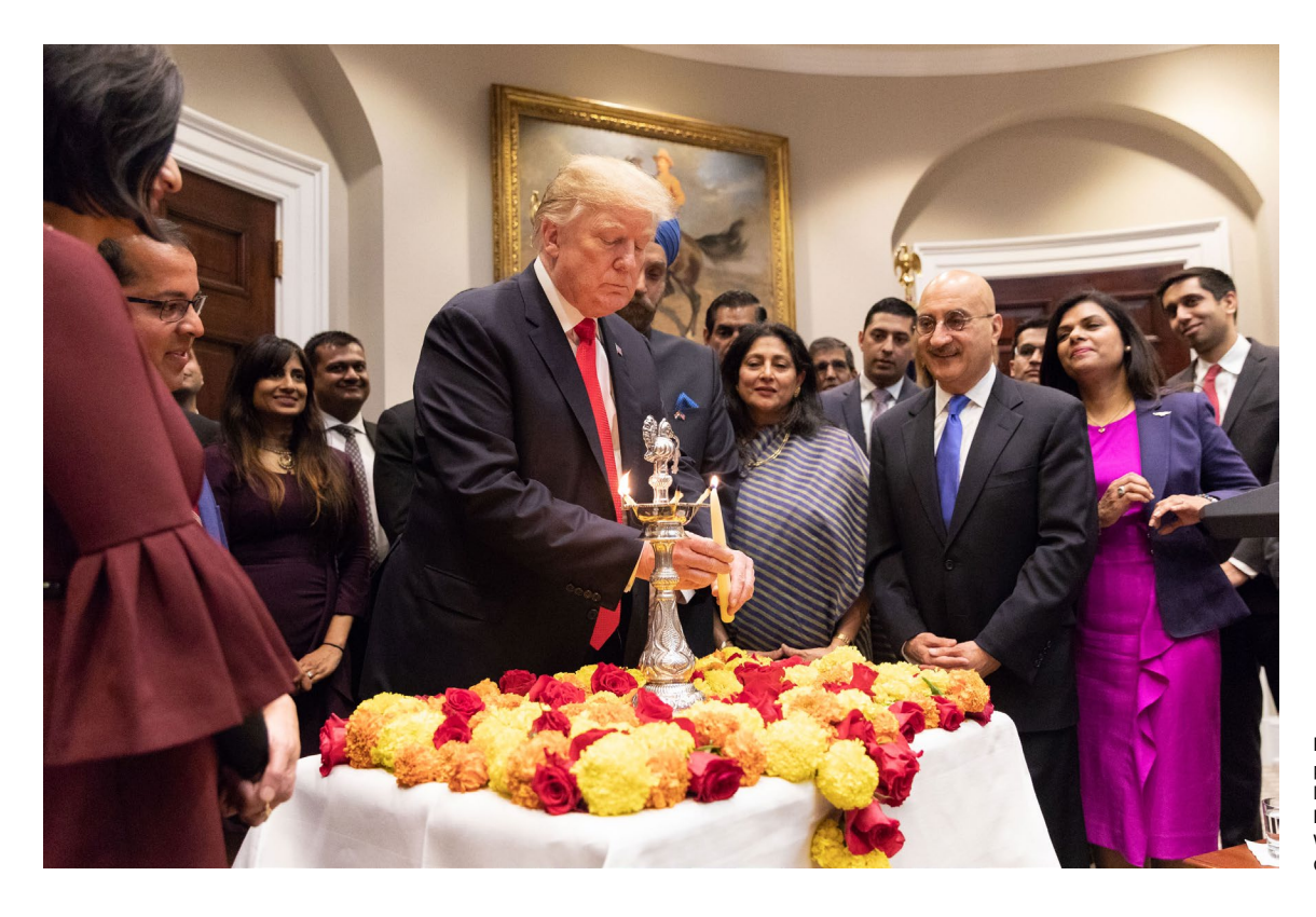
President Donald Trump participating in a ceremonial lighting on Diwali at the White House in 2018.

Evidently, therefore, HAF did not depart from the American Sangh; rather, it adopted a new strategy to work within the framework of what it called "Hindu American advocacy." In its early years, it took positions in favor of religious liberty and pluralism, introduced a Resolution commemorating Diwali in the House of Representatives, and sought to communicate and represent Hinduism to the public and government through educational materials. In the process, HAF was welcomed, almost by default, into interfaith and civil rights coalitions, many of which were seeking more diverse representation of the Hindu minority in the U.S.<sup>66</sup>