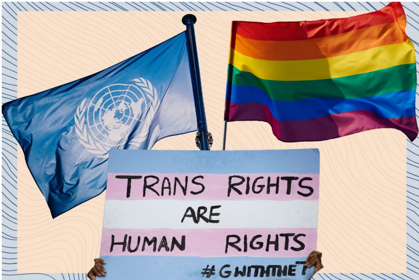
A collage of the UN flag, a Pride flag, and a poster that says “Trans Rights Are Human Rights”

How the Global Right Aims to Dismantle the United Nations