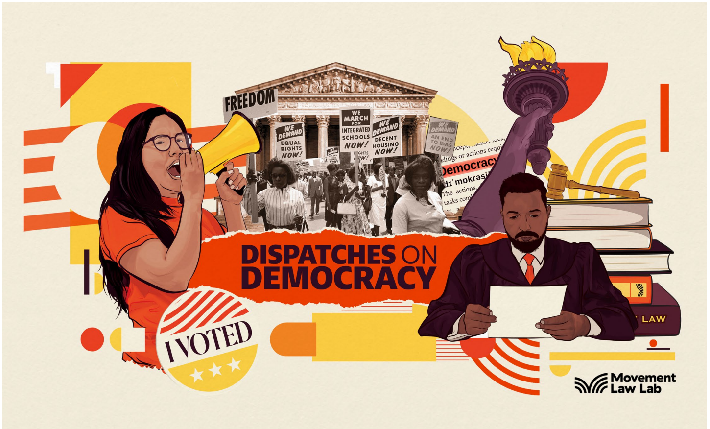
Art created by Rommy Torrico for Convergence magazine.

This article was first published by Convergence magazine on February 21, 2024. It is reprinted with permission from the publisher and authors.