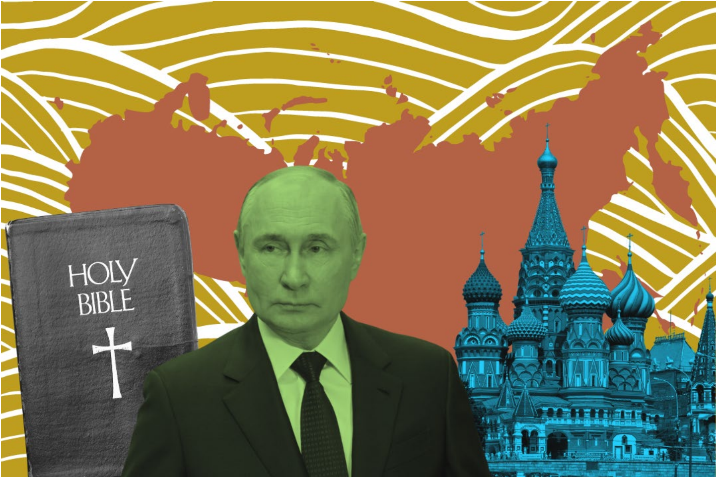
Collage of the Kremlin, Vladimir Putin, and a Bible overlaid on a map of Russia

How Russia Revives and Reverses U.S. Cold War Rhetoric