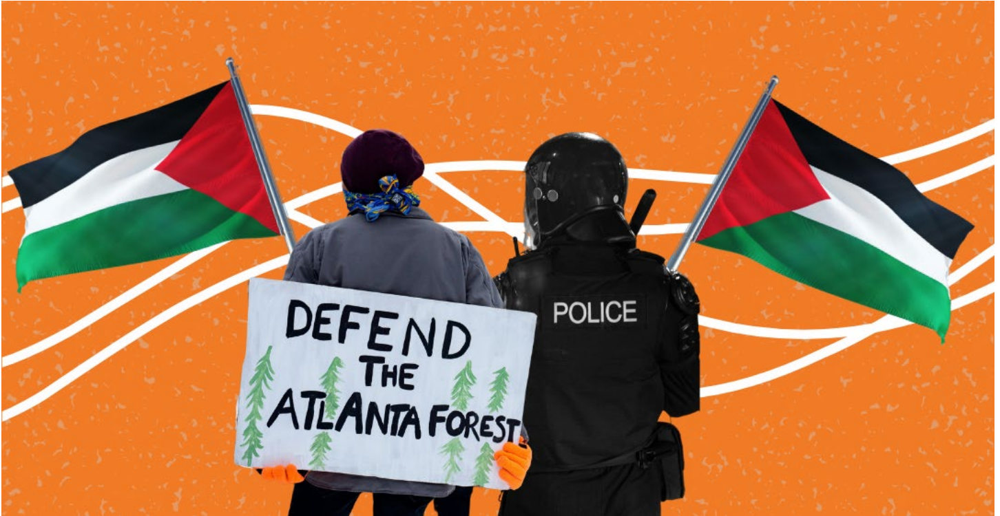
A collage of a protestor at the Stop Cop City protests, a police officer, and Palestinian flags

On January 28, CNN’s “State of the Union” host Dana Bash asked Democratic Rep. Nancy Pelosi whether she worried that Arab Americans, young people, and progressives would sit out of the 2024 U.S. presidential election due to President Biden’s support for Israel. While recognizing the need to “try to stop the suffering in Gaza,” the former House Speaker’s response pivoted quickly to attacking protests calling for a ceasefire, alleging that some were “connected to Russia.” This is “Mr. Putin’s message,” she said, warning viewers to “make no mistake, this is directly connected to what he would like to see [...] I think some financing should be investigated. And I want to ask the FBI to investigate that.” 1