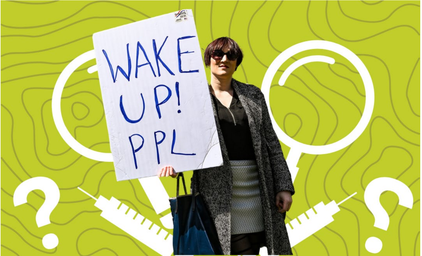
A collage of a protestor holding a sign that says "Wake Up! Ppl", syringes, magnifying glasses, and question marks