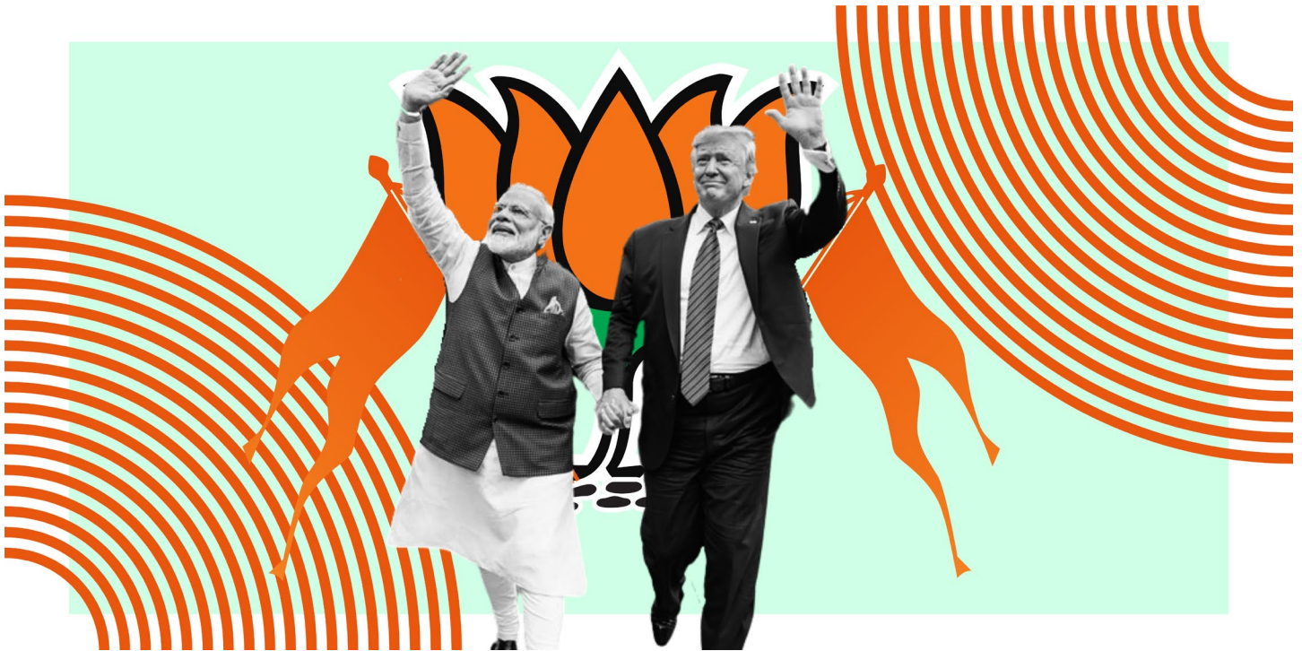
Collage of Narendra Modi and Donald Trump, saffron flags, and the logo of the Bharatiya Janata Party

India's Hindu Supremacist Movement and Its Role in the Transnational Far Right