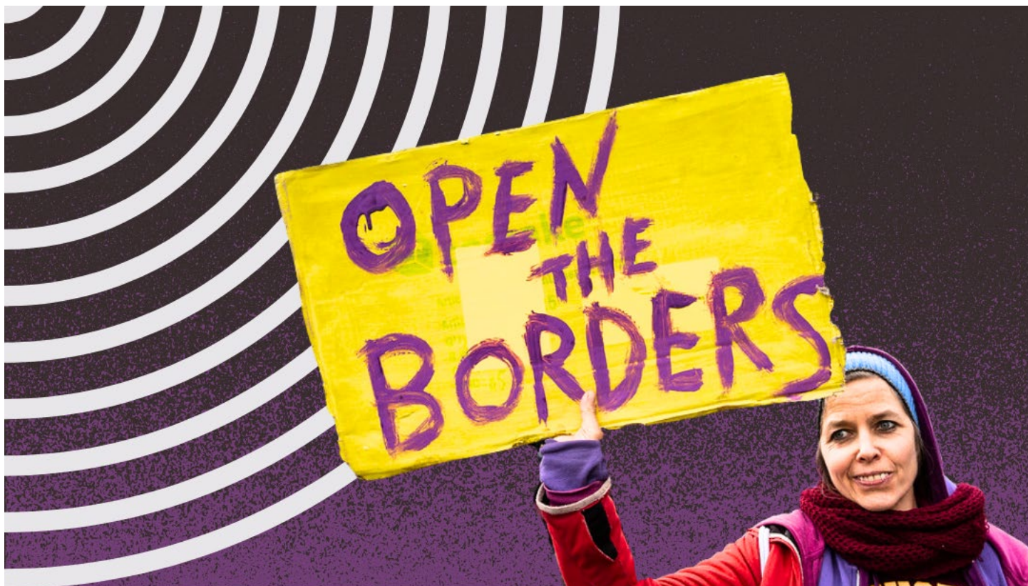
A protestor holding a sign saying “Open the Borders”

Reframing the 21st-Century Border Crisis Narrative