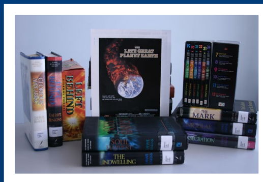
Poster advertising the 1979 film adaptation of The Late Great Planet Earth (center), surrounded by various products in the more recent Left Behind series.

But it wasn't the content alone that made Late Great a success. According to Paul Boyer, a historian of End Times thinking in the United States, Lindsey was an energetic self-marketer, savvy in the technological tools of the time: "The Late Great Planet Earth , published initially by an obscure religious publisher in Michigan, is taken up by a mass