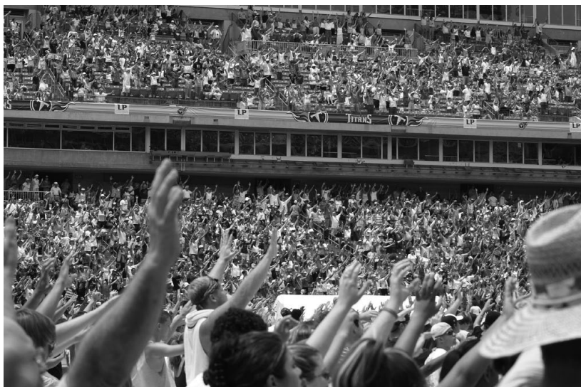
Participants at a NAR event in Nashville, TN, on July 7, 2007.

The New Apostolic Reformation, an aggressively political movement within Christianity, blames literal demonic beings for the world's ills and stresses the power of "spiritual warfare" to deliver people and nations from their power. It is rapidly gaining influence in the United States and around the globe, and aims to advance a right-wing social and economic agenda—all while reinventing the structure of Christianity.