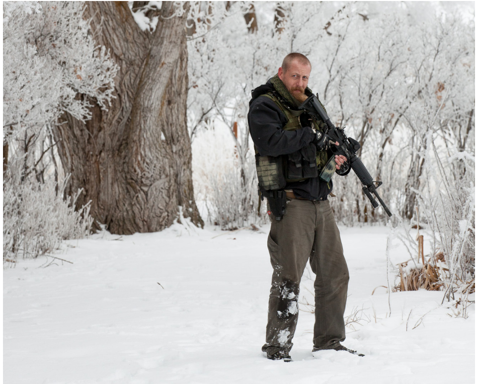
A Patriot movement member stands guard during the Malheur Wildlife Refuge occupation in Oregon in January.

The Patriot movement is a political tradition that dates back many decades. In the 1990s, when its "armed wing" ex-