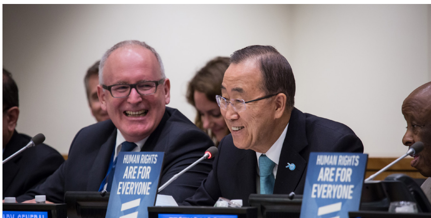
Ban Ki-moon at LGBTQ rights event on September 29th, 2015. Photo: Ministerie van Buitenlandse Zaken via Flickr. License: https://creativecommons.org/licenses/by-sa/2.0/ .

stake in upcoming changes in two crucial leadership positions. UN Secretary General Ban Ki-moon, who has energetically promoted international recognition for the rights of LGBTQ people over