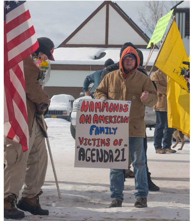
Sign during the January 2, 2016 march in Burns, Oregon, claims that the Hammond family are allegedly victims of the Agenda 21 conspiracy.

With that shift has come escalated rhetoric. Movement propagandists have claimed that the death of refuge oc-