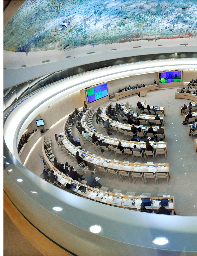
Participants at the 16th session of the Human Rights Council in Geneva, Switzerland. Photo: UN/Jean-Marc Ferré via Flickr. License: https://creativecommons.org/licenses/by-nc-nd/2.0/

Ruse’s organization praised countries that spoke against the independent expert, including Pakistan, Russia, and Saudi Arabia. 32 C-Fam quoted Nigeria’s representative complaining that the United Nations agenda had been “hi-