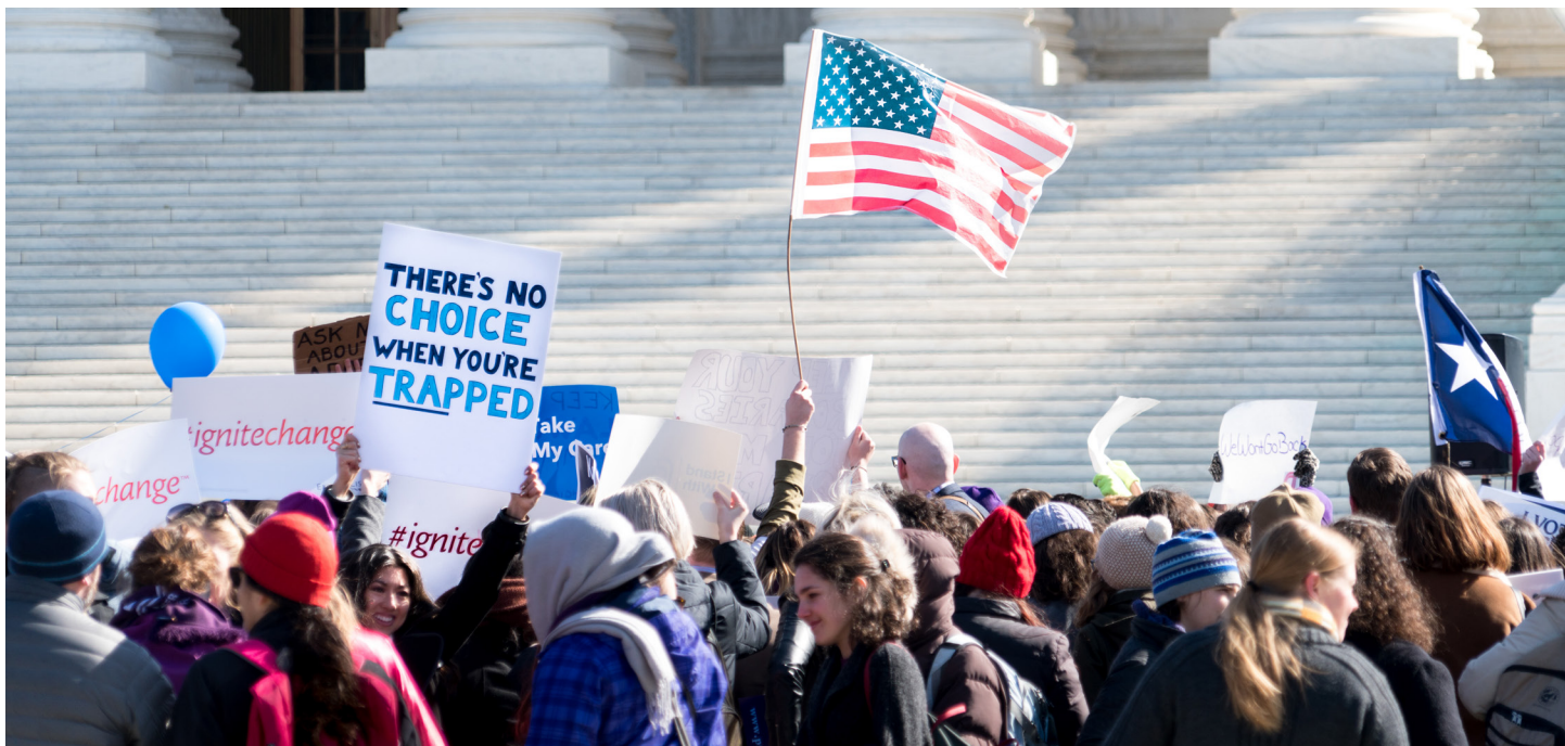
Rally in front of the Supreme Court during the Whole Woman's Health v. Hellerstedt hearing on March 2nd, 2016.

In June 2016, the Supreme Court struck down a Texas anti-abortion TRAP (Targeted Regulation of Abortion Providers) law that threatened to shutter all but a handful of the state's clinics by requiring them to meet costly ambulatory surgical center standards and for their doctors to obtain admitting privileges at local hospitals.