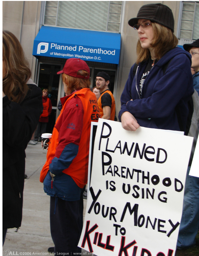
Planned Parenthood protest in Washington, D.C.