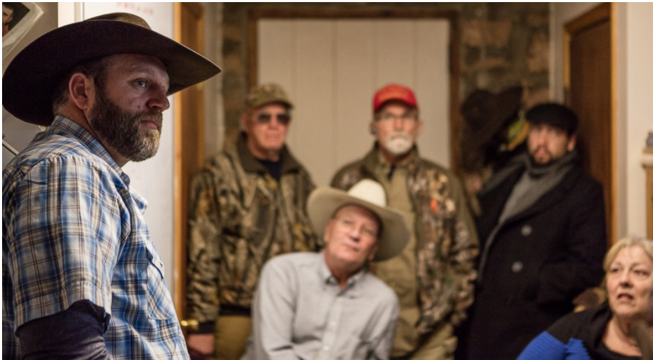
Ammon Bundy (left) at the Malheur Refuge occupation.

For years, Republicans have attempted to transfer federally owned lands—which account for almost 50 percent of the land in 11 Western states—to state or county governments, effectively privatizing them in order to circumvent regulations on logging, mining, ranching, and development. 25 Between the Bundy Ranch and Malheur wildlife refuge incidents, Patriot movement activists formed armed camps to support miners who were in conflict with federal agencies on at least two occasions. The first was in April 2015—the anniversary of the Bundy ranch standoff—at the Sugar Pine Mine in Josephine County, Oregon, and the second was at the White Hope Mine in Lincoln, Montana, in August 2015. Neither of these events garnered