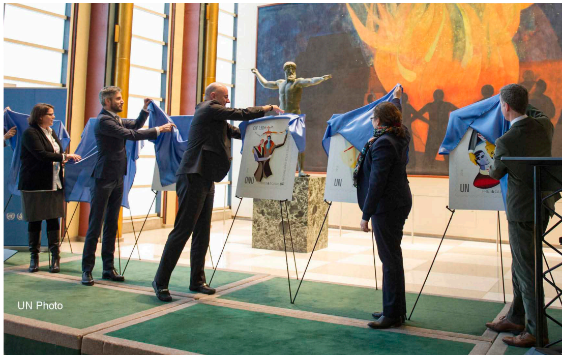
Six new stamps to promote the UN Free & Equal campaign for LGBTQ equality were unveiled at UN headquarters in February.

Russia is also a founding member of the Group of Friends of the Family, a network of 25 countries