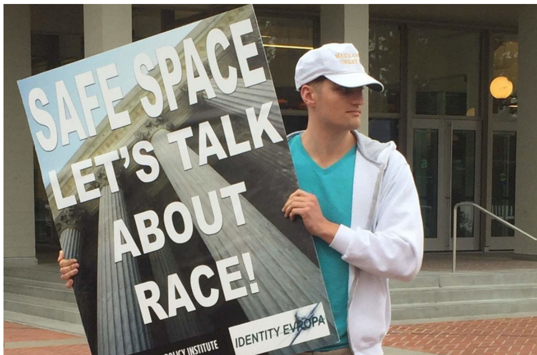
A member of Identity Evropa (a White supremacist college organization) sports a “Make America Great Again” hat at an event last year.

A dangerous aspect of this dual image is that Trumpism describes a real element of White American experience while linking it to racist and xenophobic “alternative facts.” The parts of the country that can variously be described as Trump country, “Red States,” or the older phrase “the heartland,” may be concentrated in the Rust Belt, the South, and the Plains, but can also be found scattered through “Blue” states like New York and California. I find “heartland” useful because it captures the self-understanding of the small cities, towns, rural, sub- and ex-urban areas that have long been the core of a White, largely Protestant, multi-generation U.S. experience and identity that was central to the Trump constituency. These heartland communities are currently experiencing a decline in economic opportunities, a marked increase in opiate addiction, and reduced life expectancy, 1 as well as a rise in racist xenophobia most visible as Trumpism. The convergence of economic and demographic change is not unique to our current era, and has previously led to a surge in the power and respectability of the Far Right among Whites living outside of major cities.