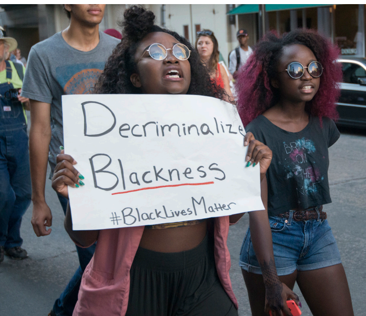
Powerful resistance movements such as Black Lives Matter have surged in recent years.

The Movement for Black Lives and others in progressive justice movements promote far more liberatory “invest/divest/reinvest” frameworks for organizing. 43 But in many jurisdictions, pro-