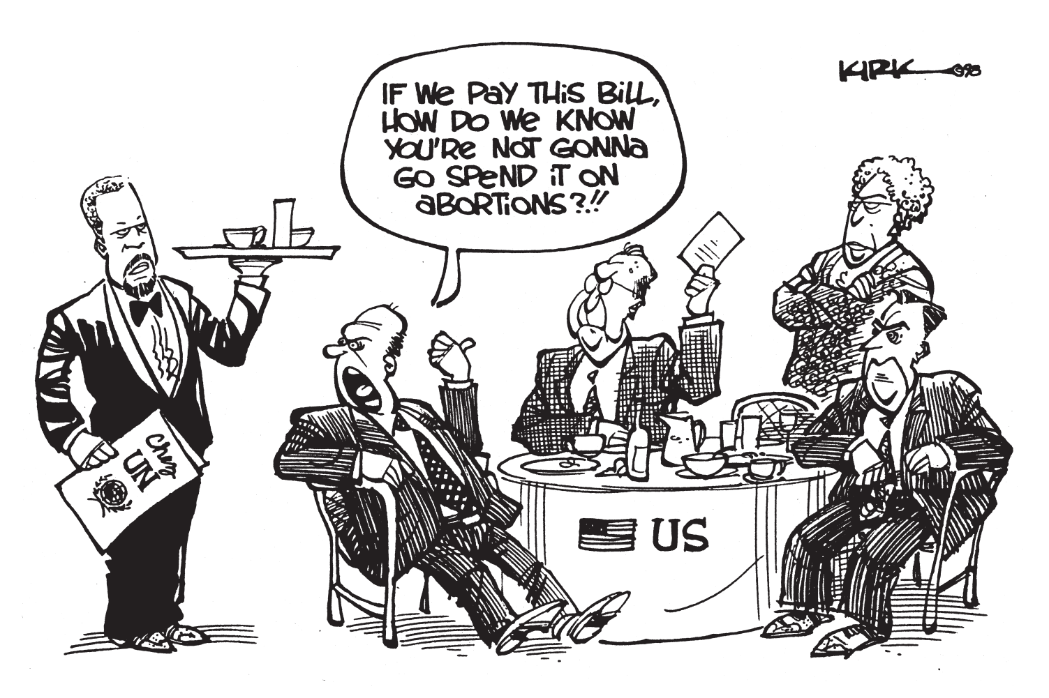
Reprinted with the kind permission of the artist.

The family values agenda is a close fit with Mormon doctrine.31 The belief that families are eternal is a central tenet in Mormon doctrine. Exaltation, the process by which men become gods, is available only within family units. Women obtain spiritual reward in the hereafter only through marriage since the priesthood, available to all men, is not open to women. During the nineteenth-century, Utah church authorities were under pressure to produce large families (as well as practice polygamy), since elite status in heaven had much to do with family size. Today, a good Mormon's spiritual duty includes having large families so that they can provide earthly tabernacles for souls-in-waiting. Not surprisingly, concludes one expert, "LDS authorities