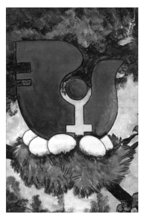
CWA poster, Family Voice, July/August 2000.

Although radically conservative NGOs and governments are still a small minority within the UN and thus most likely will not drastically change international agreements on social issues, the presence of this pro-family coalition may stall future UN negotiating processes. The Christian Right coalition's presence will change NGO gatherings as well, since a right-wing conservative voice will be increasingly influential in a setting that used to be more liberal, and where progressive women have struggled to increase consciousness about women's issues. Equally important, the Christian Right's presence at the UN may represent a new phase in Christian Right organizing-one in which the Christian Right may become a more broad-based, even international, Religious Right.