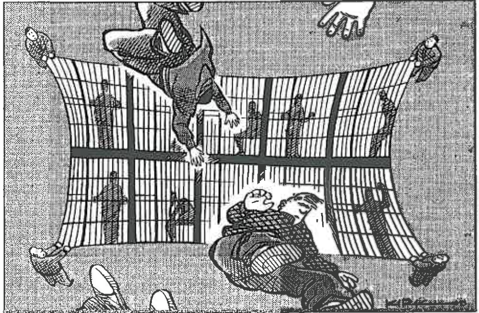
U.S. SOCIAL SAFETY NET

Despite the many differences between the Old Right and Neoconservatives, these sectors of the Right sometimes reinforce one another: